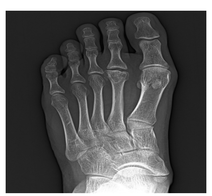
Figure 1: Right foot. Anterior-posterior radiograph demonstrating avascular necrosis of the head of the second metatarsal.

tector pad as the initial treatment. The patient used this pad at times of painful periods to relieve the pain. She also avoided from exercise activities that would bear weight onto her injured foot. The second admission to hospital was one month ago, 6 years after the initial diagnosis. Physical examination showed no anatomical deformity of the foot such as hallux valgus or pes planus. The diagnosis of chronic stage Frieberg's disease was verified by a conventional posteroanterior X-ray imaging of foot which revealed chronic stage avascular necrosis of the second metatarsal characterized by collapse of metatarsal head and fragmentation of the bone (Figure 1). After obtaining written informed consent from the patient, two gait analyses by 2-month intervals were planned and performed during painless period after physical and medical therapy.