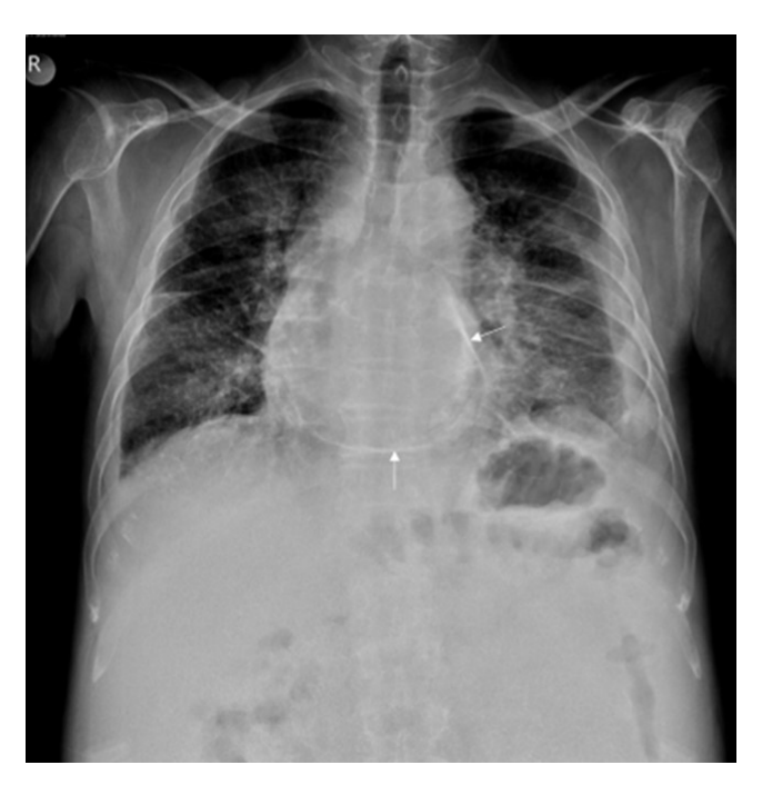
Figure 1: Posteroanterior chest radiography revealing pericardial calcifications (Arrows).

Atrial fibrillation was detected in the electrocardiography and the patient was directed to the cardiology department with the pre-diagnosis of heart failure. On physical examination, palpitations and ascites were detected in the patient, and he was pre-diag-